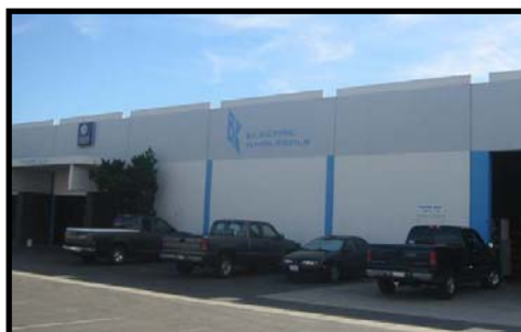
12066 Clark Street Santa Fe Springs, California 90670

Since 1976 our Santa Fe Springs location has serviced through its close proximity to all major freeways the Los Angeles* and Orange County. In an effort to improve our working relationship and to increase our level of customer service to you, here is a list of the proper B&K Electric Wholesale associates to contact for your solutions: