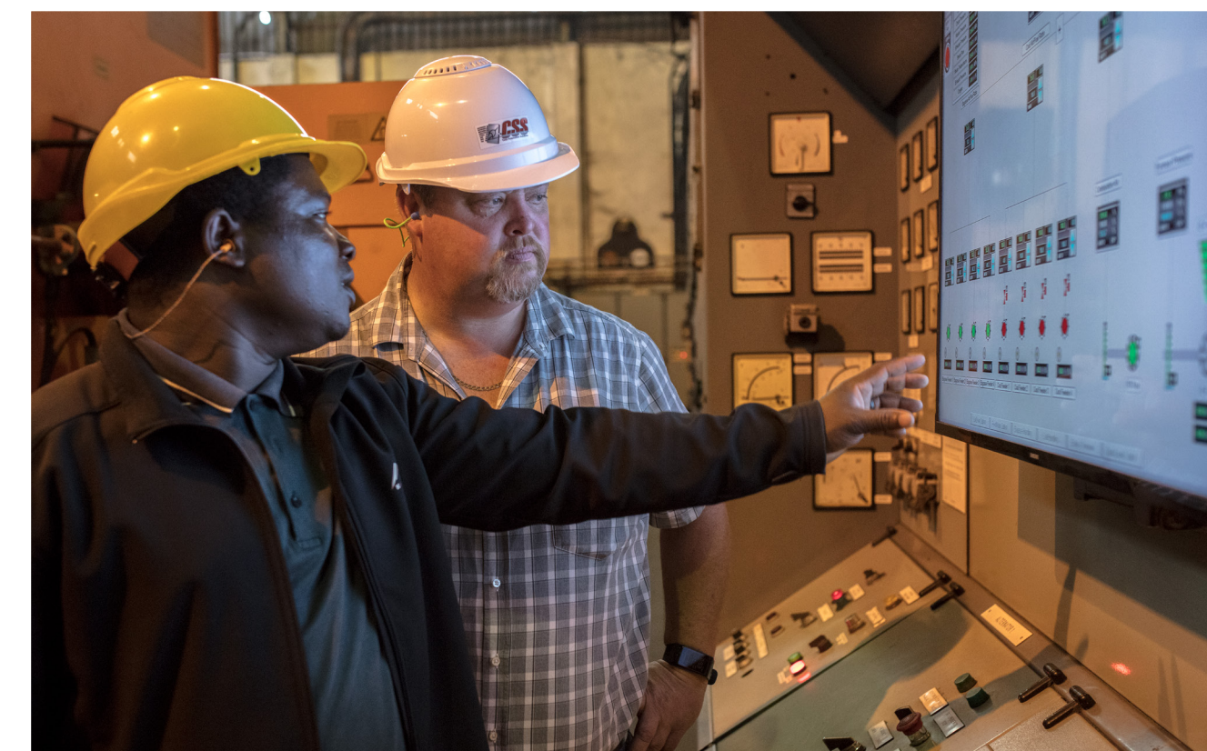
Watch the RCL Foods case study

Enhanced equipment performance visibility gives plant staff improved operational insights to safely produce higher output levels, at optimized energy consumption levels. As an example, operational efficiency is improved down to the asset level, when enhanced digitization can analyze machine cycles down to the millisecond to identify any unwanted downtime and eliminate it. South African sugar producer RCL Foods has experienced these operational improvements when they implemented the