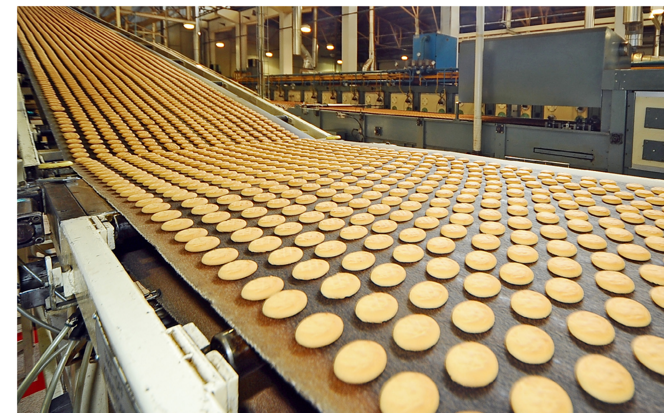
Read our smart machines white paper

Our EcoStruxure platform connects the three layers of innovation in IoT-enabled solutions – connected products; edge control; and apps, analytics & services – to help drive full IoT integration and provide you with the real-time data you need to make better business decisions.