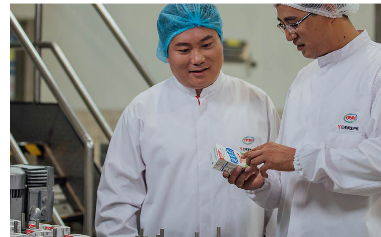
Watch the Yili Group case study

Thanks to digitization, Energy usage at the machine level is monitored and displayed so it can be better managed and optimized. With clear visibility of the devices' status and operating insights, the plant staff can keep them running at peak performance. Need proof? China's leading dairy producer, Yili Group , was able to cut energy costs by 5% while increasing operational efficiency by 19% thanks to a complete energy management solution from Schneider Electric.